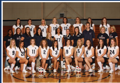
The 2009 Lady Warrior Volleyball Team