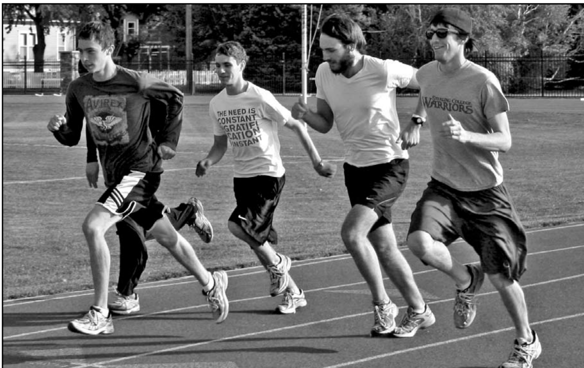
The men's cross country team runs sprints on the track during an afternoon practice as part of its training for the KCAC meet this Saturday.