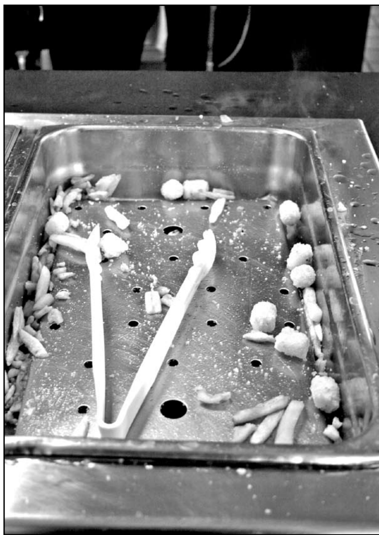
Despite efforts to keep up with the noon rush, students still find empty containers and long lines a part of their dining experience.