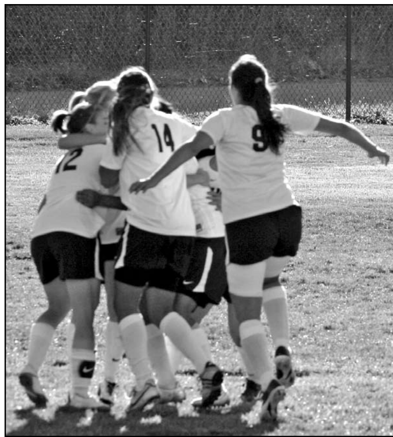
The Warrior women's soccer team celebrates after scoring the first goal against McPherson in the KCAC quarter-final match. The team's shoot-out victory advanced them to the semi-final round against Ottawa.