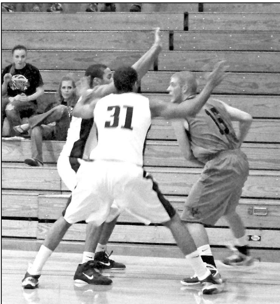
Above: The Warrior men's defense traps a Hastings College player on the wrong side of the court during the first home game of the year last Tuesday.

The Warrior Classic tournament will take place this weekend here at Sterling College.